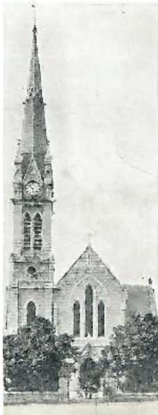
Mannofield Parish Church, as featured on the front of the Mannofield Parish Church Blotter Calendar and Year Book 1924.