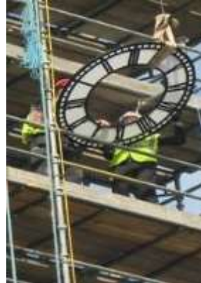
Clock face being removed for cleaning