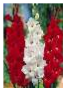
Gladioli August's birth flower

NOTE If anyone wishes to donate flowers for 14, 21 and 28 August please contact Sheila Taylor ☎01224 319289