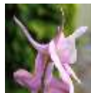
Larkspur July's birth flower