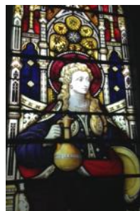
Martha, sister of Lazarus and Mary, from very close to west window See bottom left photo on cover!

We commit the future to you Lord Jesus. You have called us, we are your people. Open our eyes to see where you are leading. Open our ears to hear what you are saying. Open our minds to dreams and visions. Open our hearts to worship, love and service, This day and all days. Amen.