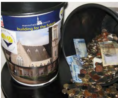
This is what £800 in loose change looks like :)

Keith's Silent Auction 20th April 2013 6.30 to 8.00pm Large Hall