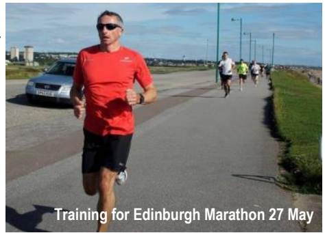
Training for Edinburgh Marathon 27 May